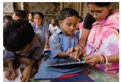
Children learn to read and write at a school in the village of Napabally, India. It's one of several villages benefiting from an integration project organized by Rotarians.